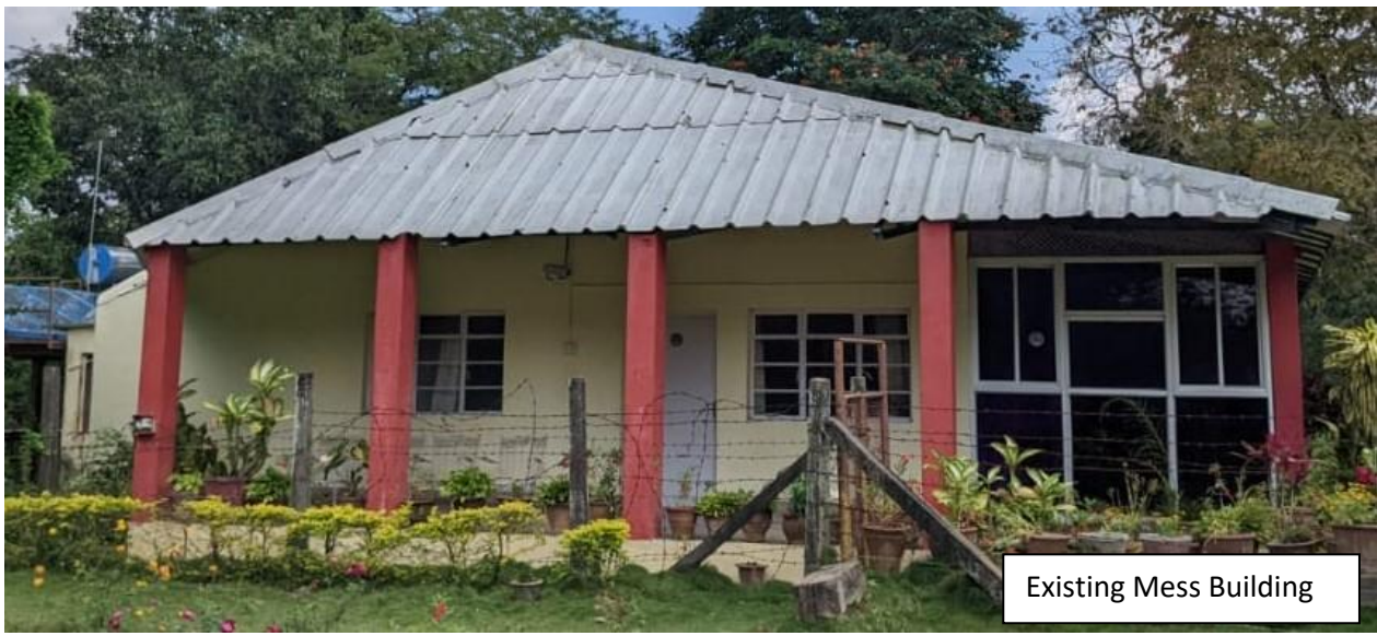
Existing Mess Building

Note: The drawing is indicative may be referred for puff panel installation (roof) layout only