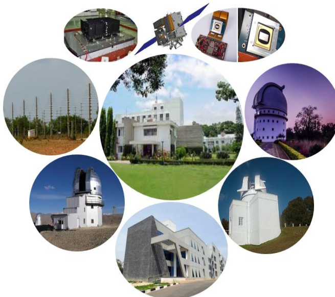
Facilities at IIA