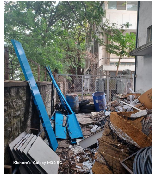
Kishore's Galaxy M32 5G