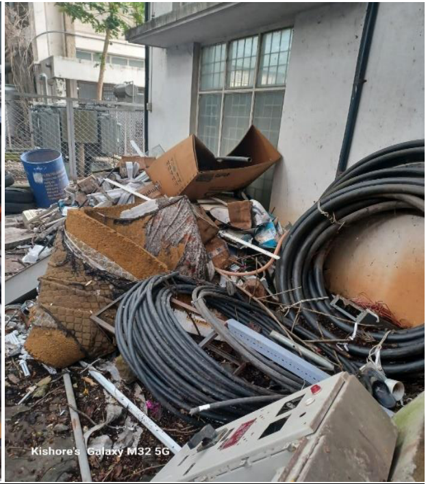
Kishore's Galaxy M32 5G