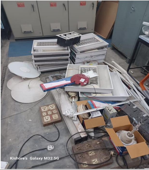
Kishore's Galaxy M32 5G