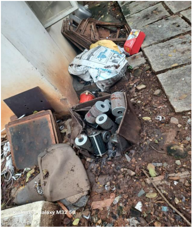
Kishore's Galaxy M32 5G